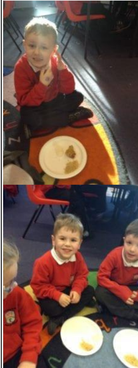
Class 2 Tree Detectives

Class 1 and 2 had lots of fun celebrating Chinese New Year today, we looked at the story of how the Zodiac calendar was created and found out this year was named after the rat. We did lots of Art and DT activities across both classes and then swapped on the afternoon before having a taste of some Chinese foods.